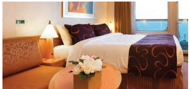
Outside cabin with ocean view balcony