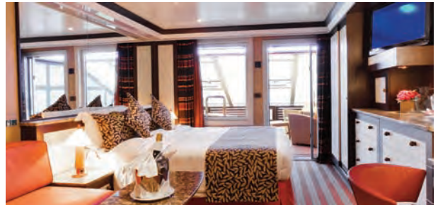
Samsara Grand Suite with ocean view veranda, jacuzzi and balcony