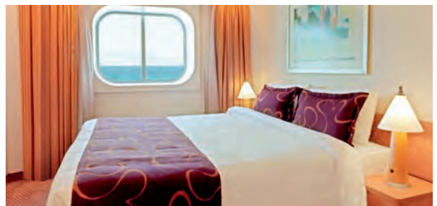
Outside cabin with ocean view