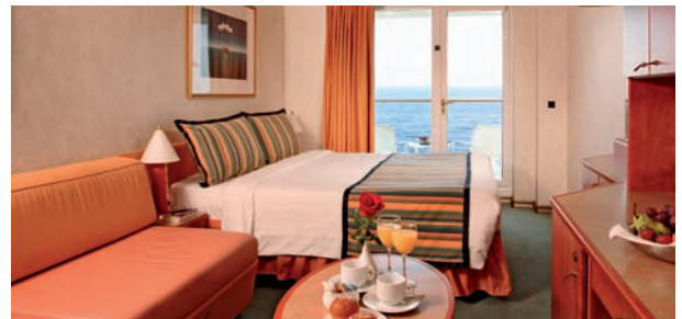
Cabin with ocean view balcony