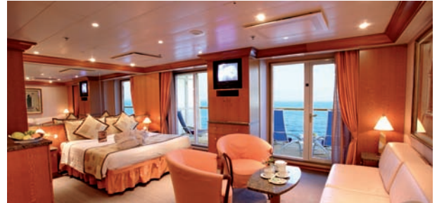
Grand Suite with ocean view balcony