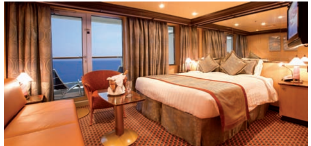
Suite with ocean view balcony