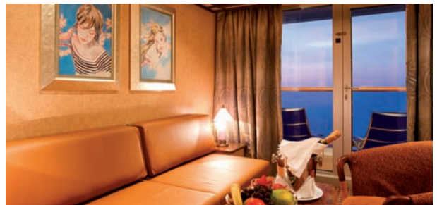
Cabin with ocean view balcony