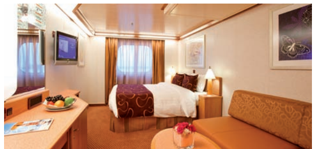
Outside cabin with ocean view balcony