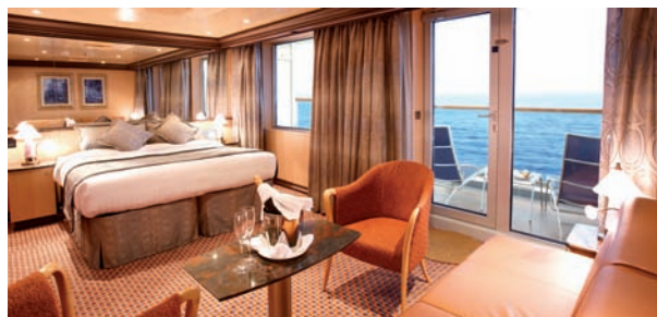
Grand Suite with ocean view balcony