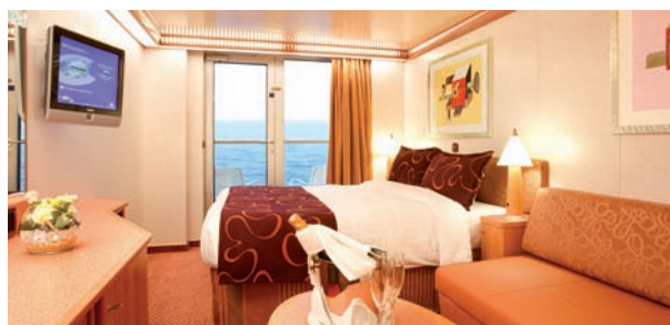
Cabin with ocean view balcony