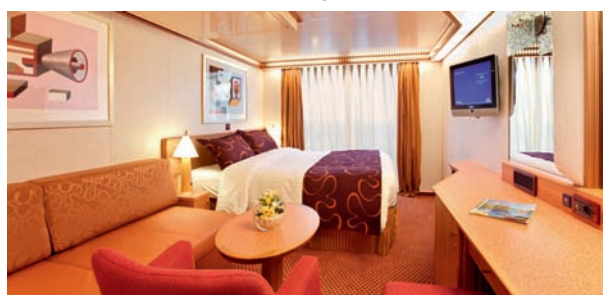
Outside cabin with ocean view balcony